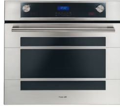
Oven Milano single Stainless Steel 30" 7168 900