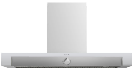
Cucinotta Hood 48" 2463 900